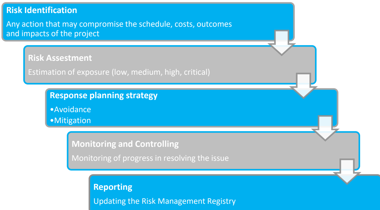
Figure 1. Risk Management Process

Figure 1 illustrates the process followed to address the risks that may occur during the project, regardless of the project's management level (Strategic, Executive and Operational).